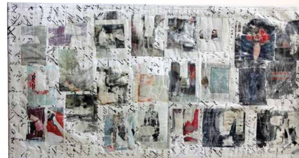
OPPOSITE PAGE TOP RIGHT: Wind at My Back (Mt. Fuji series); 2015; paper, silk; quilt; printed, stitched; 22 x 32 in. BOTTOM LEFT: 13 Bowls ; 2017; direct print on silk; quilt; 47 x 33 in.

Opus is immediately engaging. The viewer must stop, look, examine, reflect, and respond. It is a fully participatory work that bridges the divide between the viewer and the viewed, the expert and the initiate, silence and speech. It is the opus of a new dialogue that leads into the future and entices us all to follow.